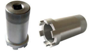
15. 38mm intern, 6 pins, € 59,50 Triumph