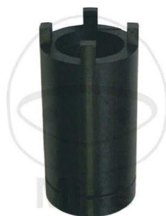
2. 24,5mm, 1/2" Drive, €17,95