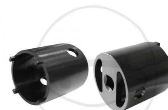
8. 55mm, €49,95