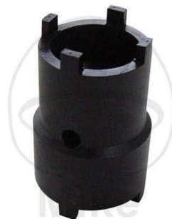
3. 26/30mm, 1/2" Drive, €22,95