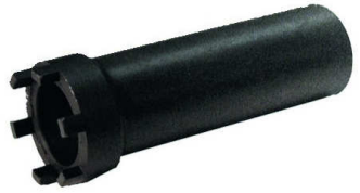
12. 42mm intern, 6 pins, € 38,50