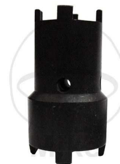
4. 20/24mm, 1/2" Drive, €22,95