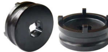
22. 40,5mm intern, 4 pins, € 22,95 Honda