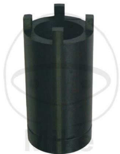
1. 20mm, 1/2" Drive, €17,95