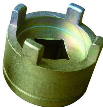
7. 24mm, 3/8" Drive, €11,95