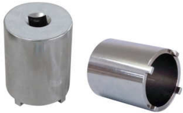
16. 41mm intern, 4 pins, € 35,50 Honda