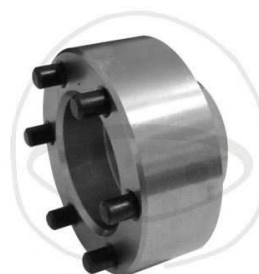
11. 24mm, €42,50