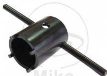
10. 27,8mm, €19,95