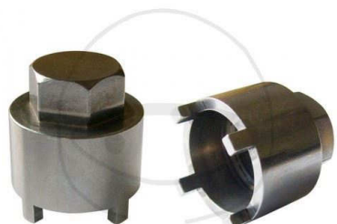
9. 24mm, €17,50