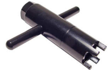
19. 20mm intern, 4 pins, € 34,95 BMW