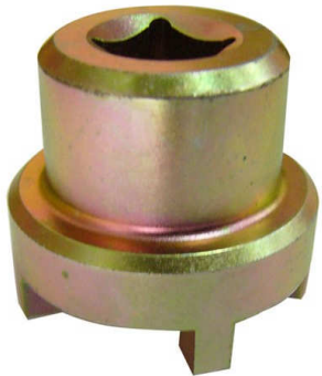
20. 30mm intern, 4 pins, € 19,95 Suzuki