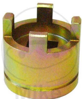
6. 18,5mm, 3/8" Drive, €11,95