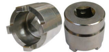
23. 28,5mm intern, 4 pins, € 22,95 Kawasaki