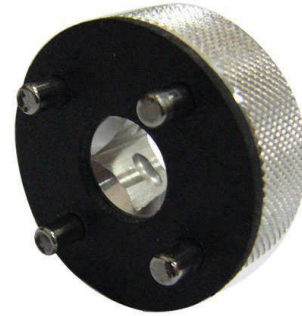
14. 23mm intern, 4 pins, € 14,50 Ducati