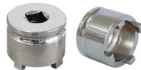
21. 34mm intern, 4 pins, € 27,95 Kawasaki