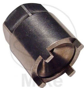
5. 15mm, 3/8" Drive, €11,95