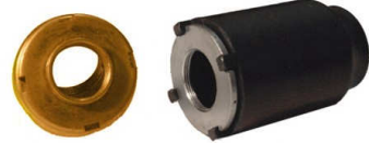
13. 36mm intern, 4 pins, € 37,50