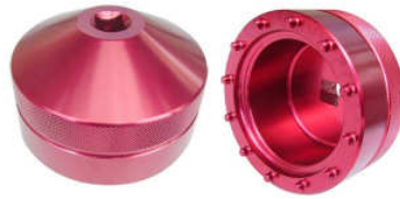
17. 74,5mm intern, 12 pins, € 89,50 Mv Agusta